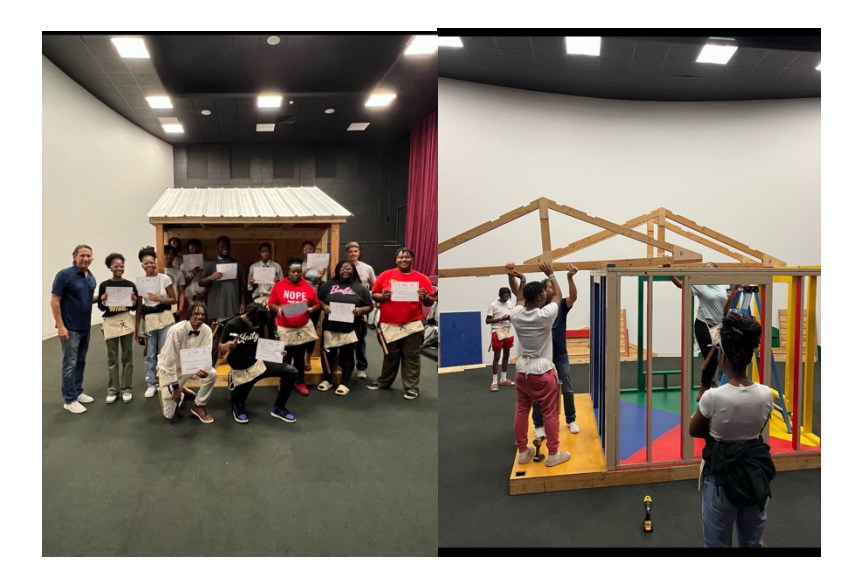
HammerBuild Wallace State Community College, Selma, AL June 28, 2023

Wallace State Community College – 15 students ranging from 9th to 12th grade and attending 4 different high schools were impacted. This build was in collaboration with Wallace State Community College's Summer Program, and other partners in this endeavor included IBM, NASA Space Grant Consortium, Best Buy, Alabama A&M University, Stillman College, and the University of Alabama-Huntsville.