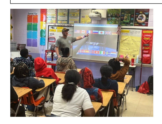
Livingston Jr. High School Livingston, AL May 10, 2023