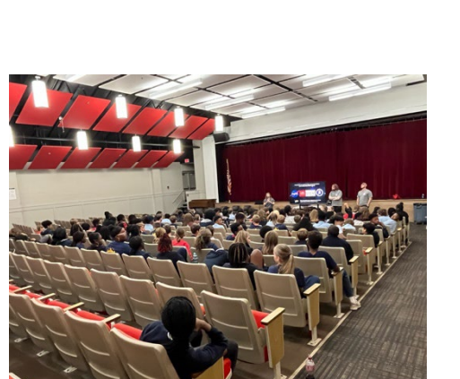
University Charter School Livingston, AL May 10, 2023