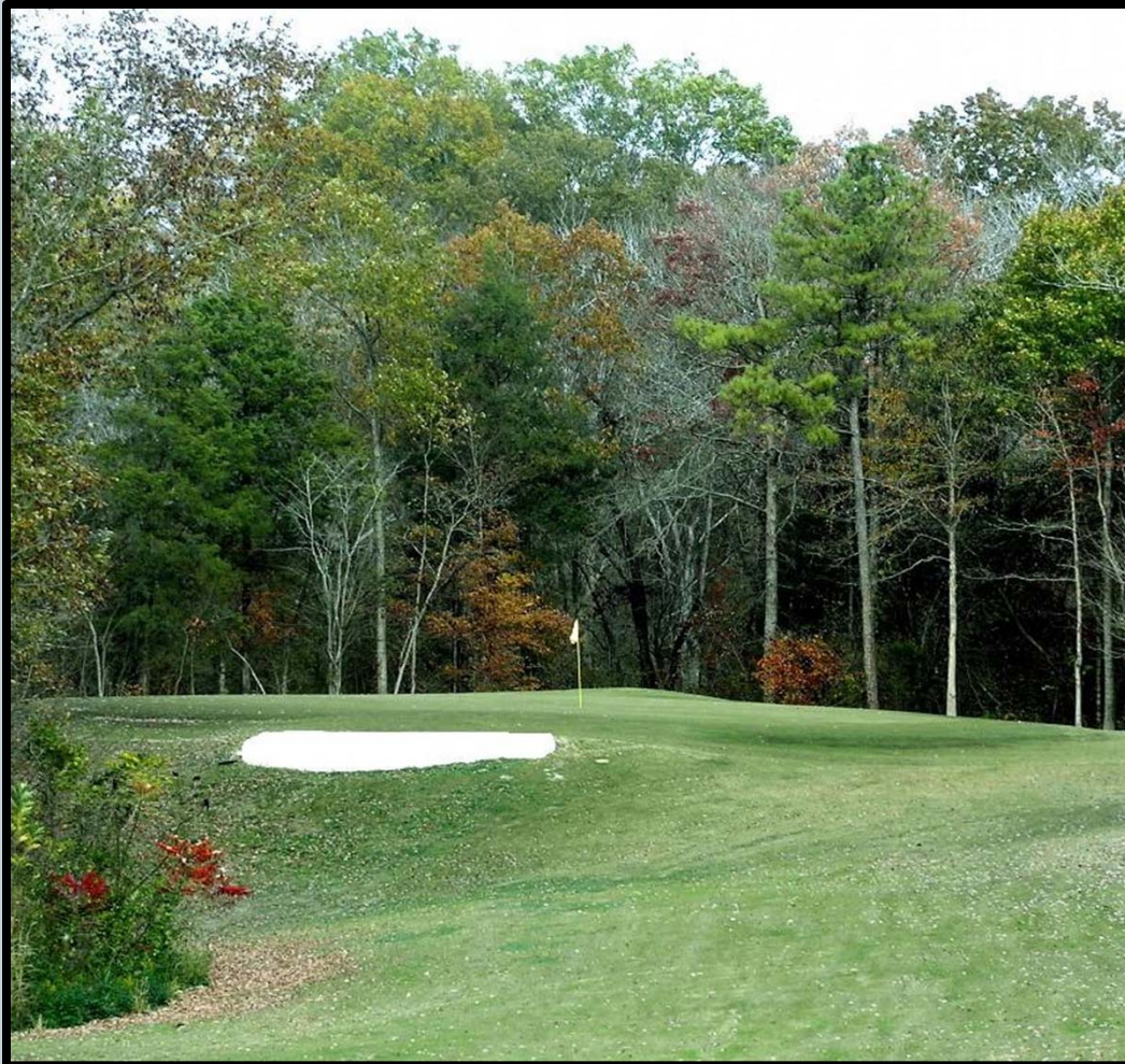
The Ravine Golf Course